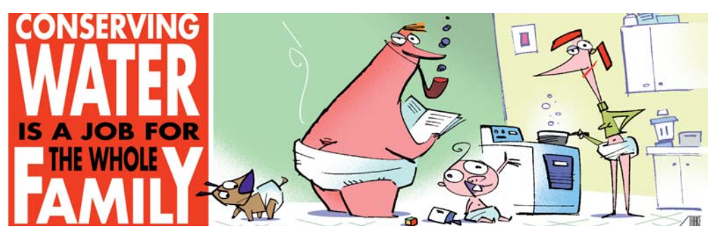
BY BOB STAAKE FOR THE WASHINGTON POST

"Remember, using an adult diaper not only conserves water—you'll also never miss another important moment of televised football."